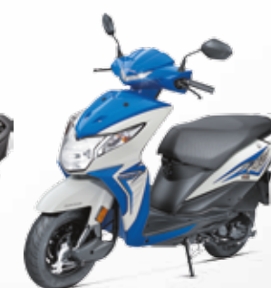
Candy Jazzy Blue

Dio meets Bharat Stage IV norms. + The technical specifications and design of the vehicle may vary according to the requirements and conditions, without any notice. * Accessories shown in the picture are not a part of the standard equipment. ** Conditions apply. ^ Service more frequently when riding in unusually wet or dusty areas. Product shown in the picture may vary from the actual product.