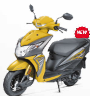
Pearl Sports Yellow