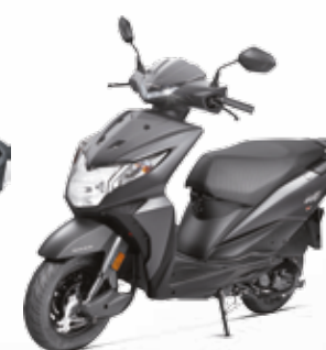
Matte Axis Grey Metallic